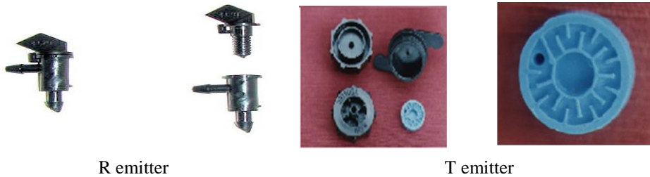
Fig. 1: Emitters' design and internal components.

Distribution uniformity (DU) indicator was used to express how the emitters can distribute water uniformly to the crop or soil (Burt et al. , 1997). Distribution not only can deprive portions of the crop of needed water, but, furthermore, can over-irrigate portions of a field, leading to water-logging, plant injury, salinization, and transport of chemicals to the ground water (Solomon 1983). In order to measure DU, laterals were imaginary divided into 4 quarters. At 10m operation head, samples of 7 emitters from each quarter were chosen to measure the flow rate of the chosen emitters. Graded cup 1 ml accuracy was put under each emitter sample all at once for 2 minutes to calculate the emitters' flow rate.. DU was calculated using the following equation (Marriam and Keller, 1978):-