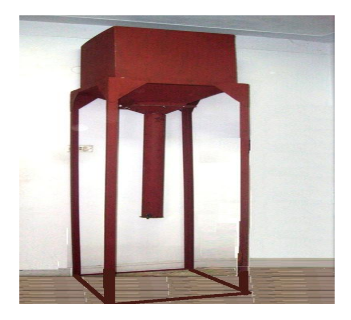
Figure (1): shown experiment set up to 8 cm diameter pipe with 1 m length and 90° vertical angle.

Gravity flow experimental setup (fig. 1) was designed and constructed to evaluate the flowability of rice grains and their products by gravity through different parts of the system. The experimental unit was constructed which suitable for samples of 75 kg of paddy up till 150 kg of white rice.