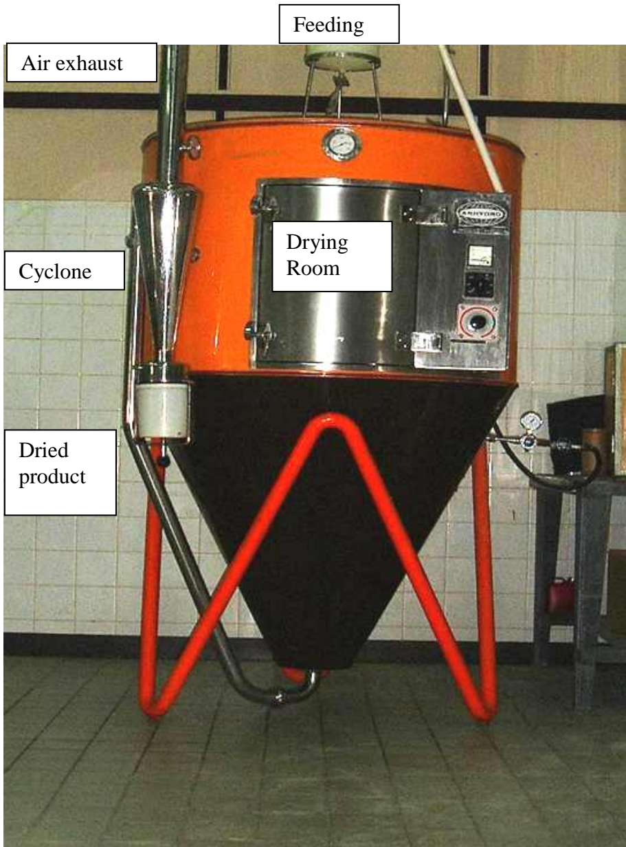
Figure 1a: Photograph of the lab-scale spray dryer.