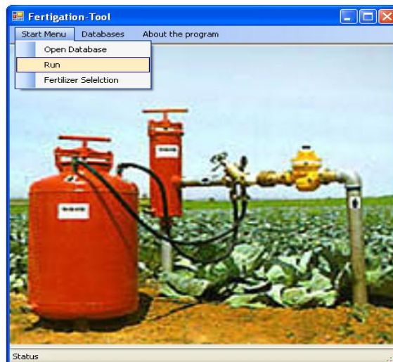
Fig (2): The program user interface.

This consists of menu bar comprising three menus. The first one is start menu: consisting of three orders (open database, run and fertilizer selection). The second menu bar consists of several orders i.e. (climate database, soil database, water database, farm database, fertilizer database, manure database, crop database and irrigation system database) and the third menu is information about the program, as shown in Fig. (2).